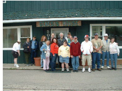
The Genesis House gang kicks off the Walk-A-Thon

Locally, the Genesis House staff have all seen an increase in responsibilities as placement managers for our growing TE program and also increased involvement with social activity responsibilities.