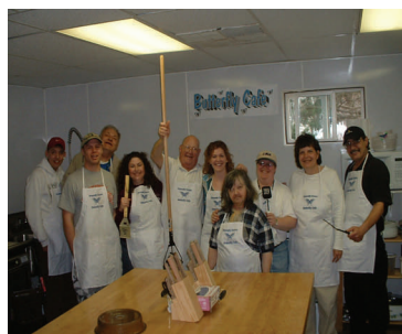
The Butterfly Café shows off their new aprons!

Happy Spring! We are so excited to share all of the new changes that have taken place in our unit! The biggest change, as many of you already know, is that we have officially changed our unit name to the "Butterfly Café!" We did this because we were looking for a catchy name that would capture all the amazing things that our team does on a daily basis. As you can see, in the picture to the left, the name has really caught on!